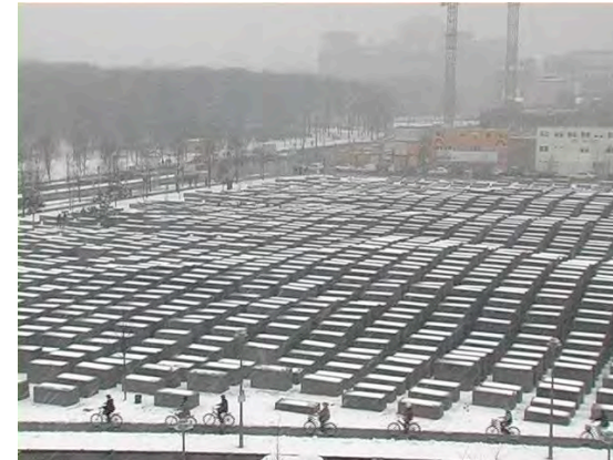
EIN WEITES FELD , filmed at the Berlin Memorial, screens on Holocaust Remembrance Day.