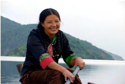
The Women's Kingdom , a film by Xiaoli Zhou