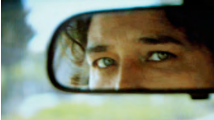
My Land Zion , a film by Yulie Cohen